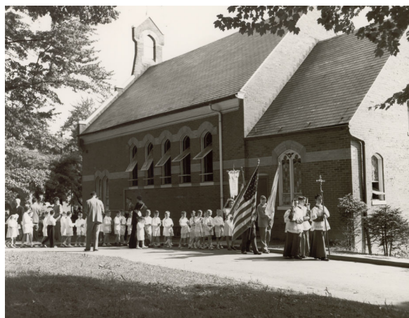
CHAPEL SIDE OF THE ORIGINAL CONVENT