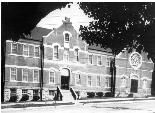
ORIGINAL VILLA MARIA CONVENT

The original Villa Maria Convent needed to be enlarged and required extensive remodeling. Twenty-six Sisters were assigned to St. James School at this time. A new spacious brick building was completed in 1963, set back from Spring Street behind the original convent. This is the Saint James Convent today. The original convent was razed in 1964.