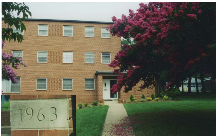
SAINT JAMES CONVENT COMPLETED IN 1963